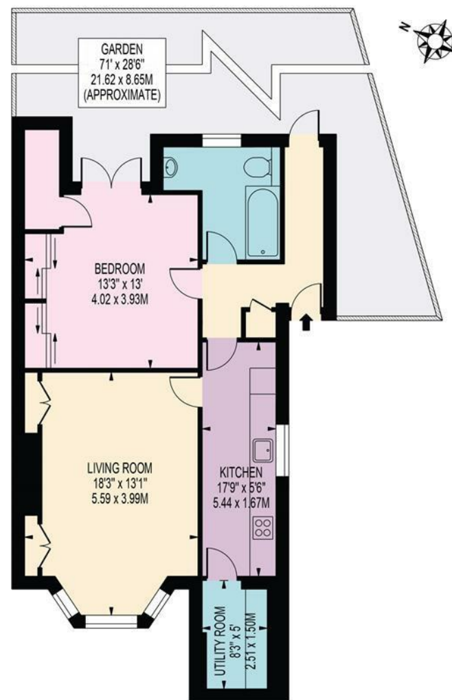
GARDEN FLAT FOR ILLUSTRATION PURPOSES ONLY

DORNCLIFFE ROAD APPROXIMATE GROSS INTERNAL FLOOR AREA: 698 SQ FT - 64.87 SQ M